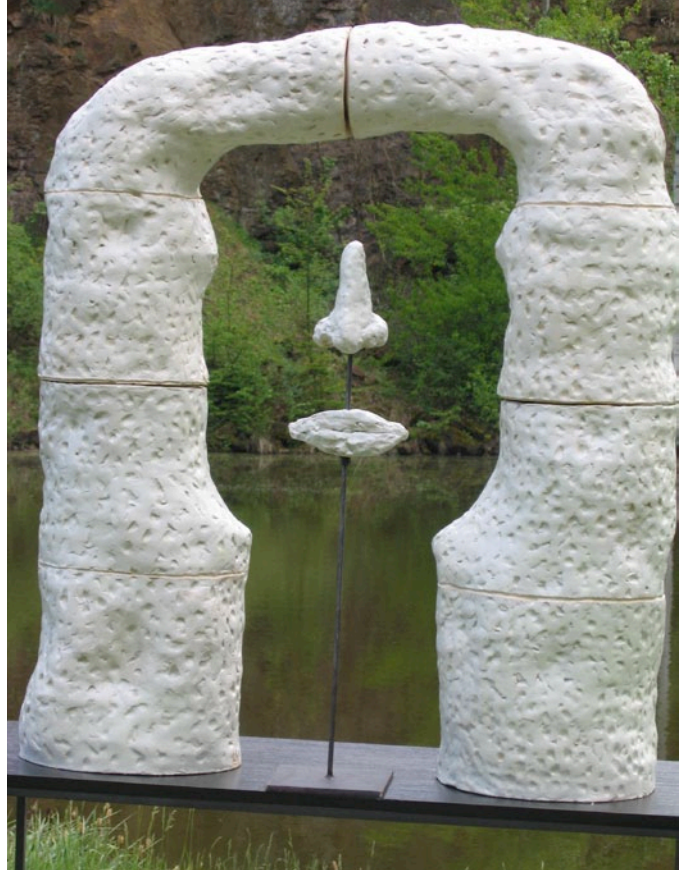
Facing page, top: Shameful – Figured Out . Facing page, below: Colorful – Back to Stone . Left: Standing – Back to Stone . Above: Untouchable Head – Cut Figures .

which are cut out along prominent body lines and thus permit the viewer to see through them, she created works of great enchantment.